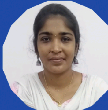
Lavanya Vee Tech