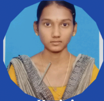
Harini Saicle Solutions