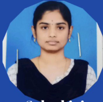
Subashini Saicle Solutions